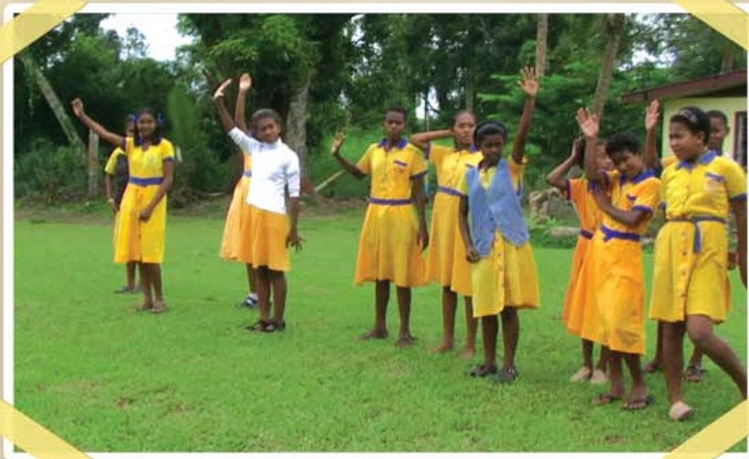
Class 7 Students of Vunimono Arya School participating in the Hand Washing Race Activity.

Note: these are just some of the questions that could be asked, others could be added depending on the surroundings and different scenarios