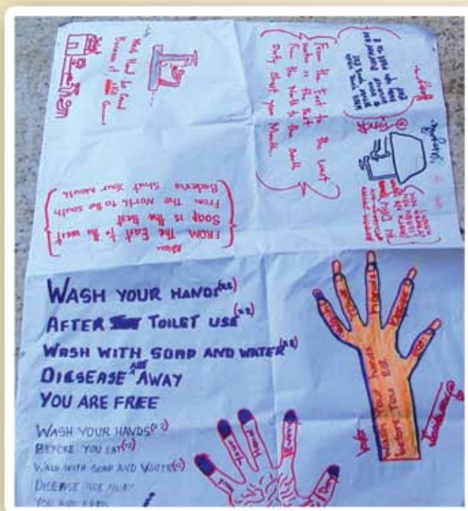
Sushanita, Priashana, Tirisa, Setaita, Ivamere - Vunimono School Primary

Wash your hands; wash your hands with soap and water. Make sure to clean your fingers and finger-tips, back and front, wrist up to wrist, rinse and pour out water.