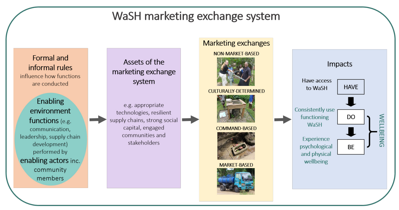
Figure 1: The WaSH marketing exchange system. WaSH marketing exchange systems are comprised of functions, performed by actors using rules, which creates assets that enable all types of WaSH marketing exchanges, which should generate not only access to WaSH, but also wellbeing impacts. Note, Command-based and Culturally-determined exchanges are also non-market-based exchanges; for the purposes of this communication 'non-market' refers to other types of non-market exchanges, such as donations and charitable exchanges.

Most of the informal settlements we worked with had been involved in previous WaSH programs implemented by a wide range of enabling actors. Even when the program resulted in WaSH installations, and residents were therefore considered to have attained access to improved water and/or sanitation according to the WHO/UNICEF Joint Monitoring Programme, this did not always lead to them achieving their wellbeing potential.